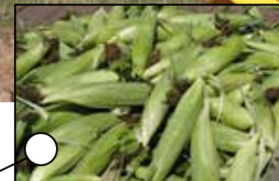
Premium product quality: Harvest fresh market sweet corn with the efficient CP100

Convenient pull-type harvester: The CP100 provides gentle harvesting in a one-row tractor drawn model. Picking hundreds of cases of quality sweet corn is as easy as starting your tractor.